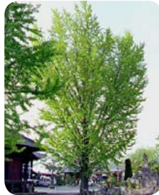
Ginkgo Biloba - male Maidenhair tree