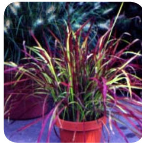
Imperata cylindrica 'Red Barron' Japanes Blood Grass