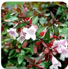
Abelia 'Edward Goucher' Glossy Abelia