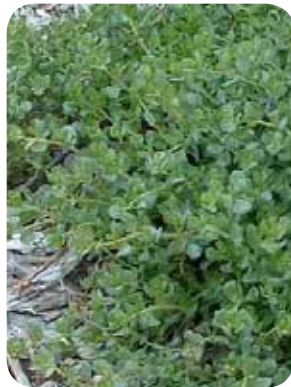
Baccharis Pilularis Coyote Bush