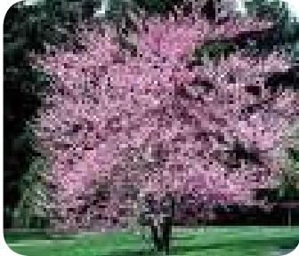
Cercis Canadensis Eastern Redbud