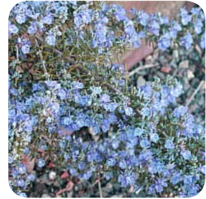
Rosemarinus Prostrata Dwarf Rosemary