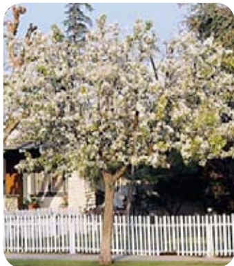
Pyrus Kawakami Evergreen Pear