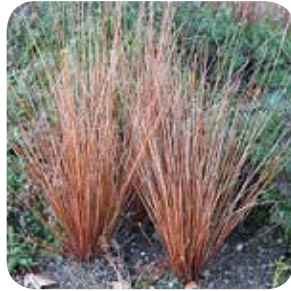
Carex Buchananii Sedge