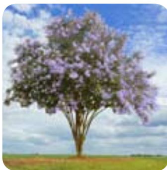
Lagerstroemia Muskogee Crepe Myrtle