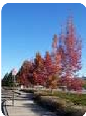
Liquidambar Liquid Amber – Palo Alto (*surface roots can cause sidewalk damage)