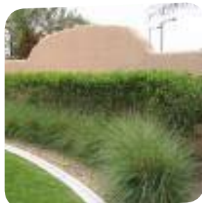
Muhlenbergia Rigens Deer Grass