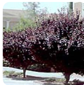
Prunus 'Krater Vesuvius' Flowering Plum