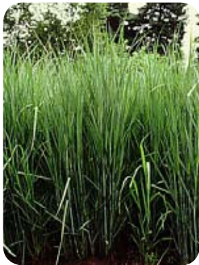
Panicum Vigatum Switch Grass