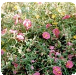
Cistus Hybridus White Rockrose