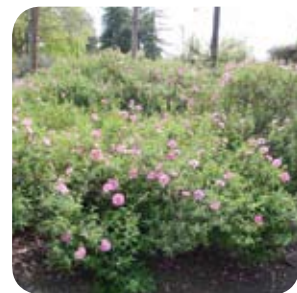
Cistus Purpureus Rockrose