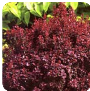
Berberis T 'Rosy Glow' Japanese Barberry