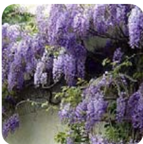
Wisteria Chinensis Wisteria Vine