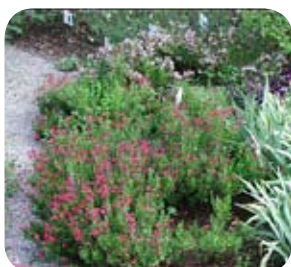
Salvia Gregii 'Big Pink' Autumn Sage