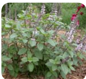
Rosmarinus 'Tuscan Blue' Tuscan Rosemary