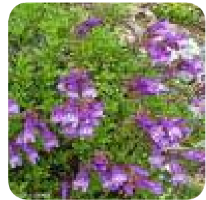
Penstemon hybrids Variety