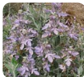
Teucrium Fruticans Bush Germander