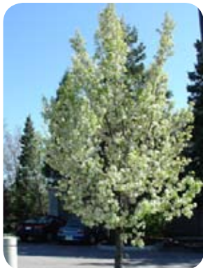
Pyrus 'Chanticleer' Chanticleer Pear