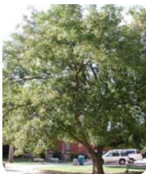
Pistacia Chinensis Chinese Pistache