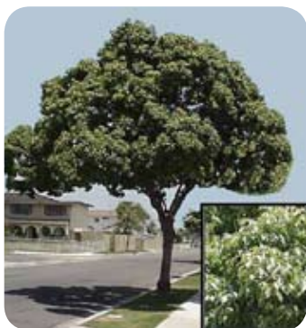
Cinnamomum Camphor Camphor Tree