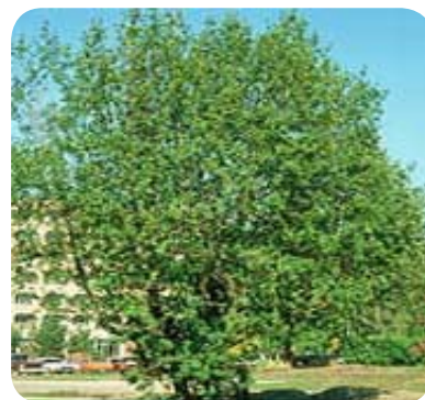
Umbellularia Californica California Bay