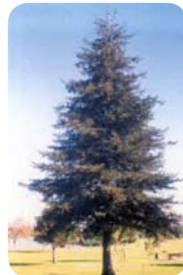
Sequoia Sempervirens 'Aptos Blue' Coast Redwood