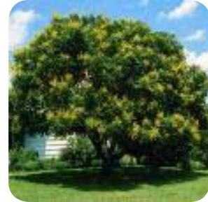
Koelreuteria paniculata Golden Rain Tree