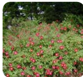
Rosa 'Meidiland Red' Meidiland Rose