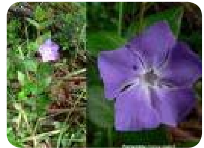
Vinca Major Periwinkle