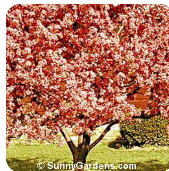
Malus Floribunda 'Radiant' Flowering Crabapple