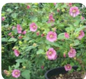
Anisodontea 'Tara's Pink' Cape Mallow