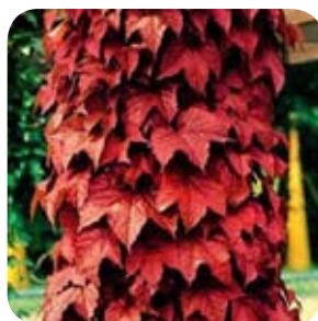
Parthenocissus Tricuspidata Boston Ivy