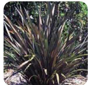
Phormium 'Jack Sprat' Dwarf Flax