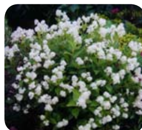
Ceanothus Gri. 'Yankee Point' Wild Lilac