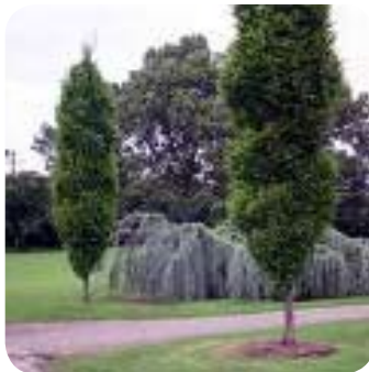
Carpinus 'Fastigata' Hornbeam