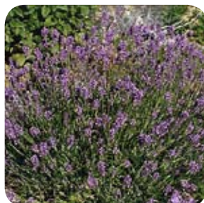
Lavandula Angustifolia Lavender