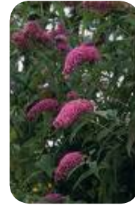
Buddleja davidii Butterfly Bush