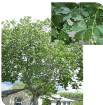
Platanus 'Columbia' London Plane