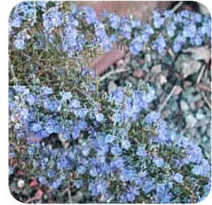
Rosmarinus Officinalis "Prostrata" Rosemary