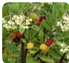
Arbutus Unedo "Compacta" Strawberry Bush