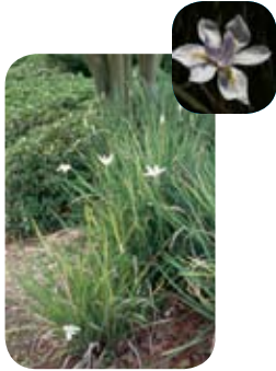
Dietes Iridioides Fortnight Lily