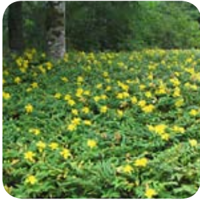
Hypericum Calycinum Aaronsbeard