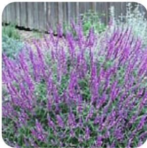
Salvia leucantha Mexican Bush Sage