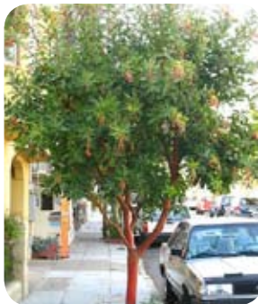
Arbutus Unedo Standard Strawberry Tree