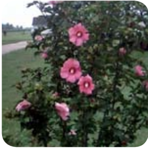
Pink Carpet Roses Rose