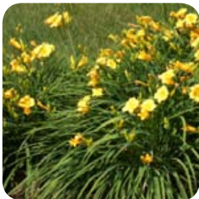
Hemerocallis 'Stella De Oro' Daylily