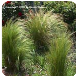
Nassella Tenuissima Mexican Feather Grass