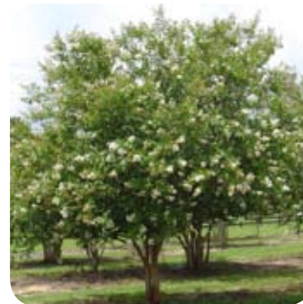
Lagerstroemia 'Natchez' Crepe Myrtle