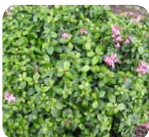
Escallonia 'terri' Escallonia