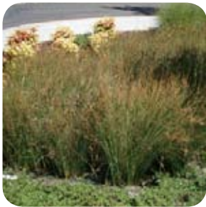
Swale grasses Mow free blend from delta bluegrass