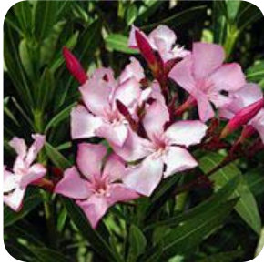
Nerium Oleander Oleander