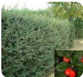
Cotoneaster Microphylla (now called C. congestus) Pyrenees Cotoneaster