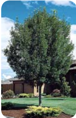
Fraxinus Oxycarpa Raywood Raywood Ash