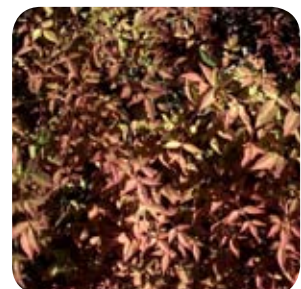
Nandina 'Compacta' Heavenly Bamboo