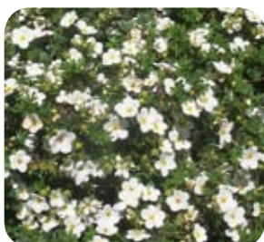
Teucrium Fru. 'Compactum' Dwarf Bush Germander