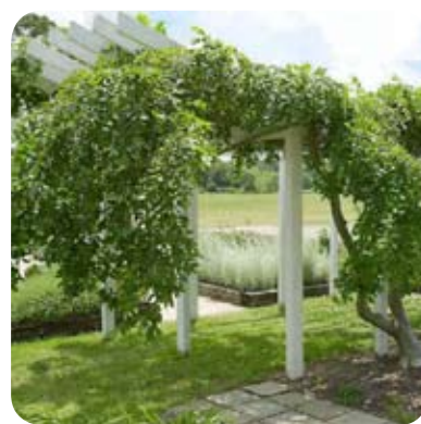
Celtis Sinensis Chinese Hackberry