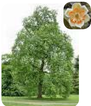
Liriodendron Tulipifera Tulip Tree