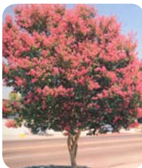
Lagerstroemia 'Tuscarora' Crepe Myrtle