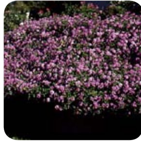
Lantana Montevidensis Lantana