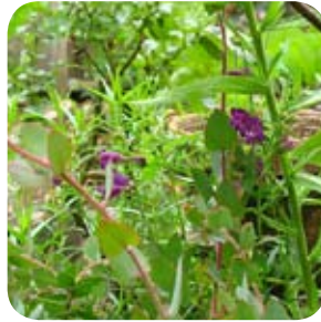
Penstemon Heterophyllus Mountain Pride