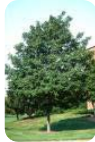
Acer Palmatum Japanese Maple