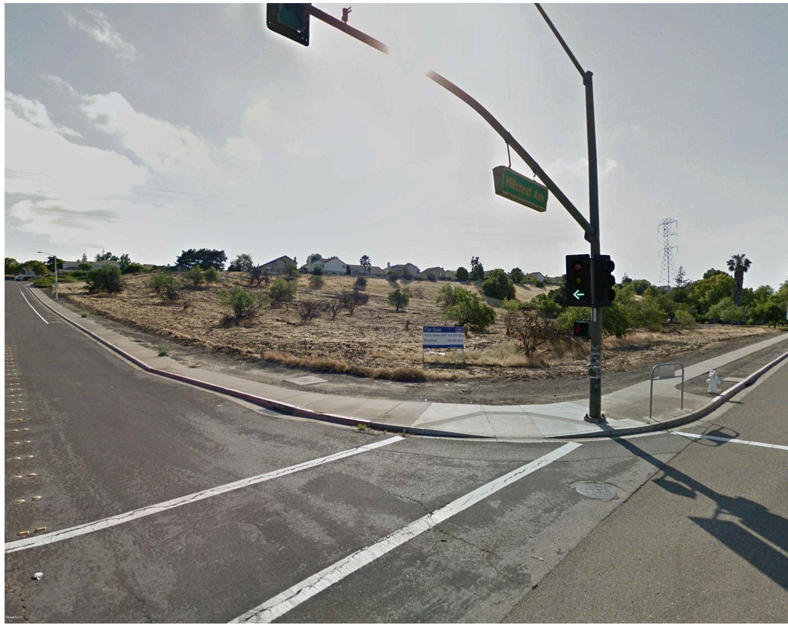
IMAGE 1 - CORNER OF WILDFLOWER AND HILLCREST