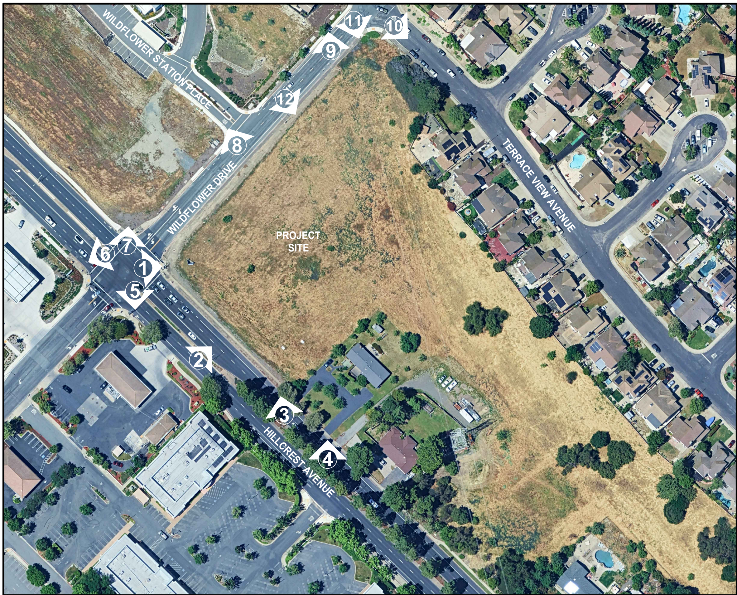
PHOTO LOCATION KEY PLAN