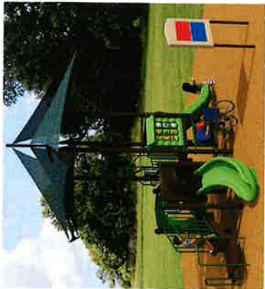
Play Structure for 2-5 age by Miracle PlaySystems, Inc.