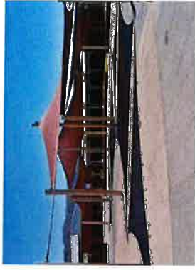
3-Point Shade Sail Structure by USA Shade, Inc.