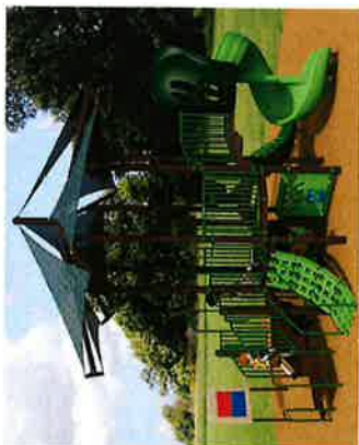
Play Structure for 5-12 age by Miracle PlaySystems, Inc.