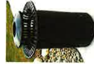
Trash & Recycling Receptacles by Kay Park & Recreation