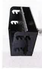
Adjustable Park Grill by Kay Park & Recreation (37" Ht./ In-ground Mounted)