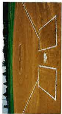
Soccer Field Overlaid by Baseball Field