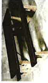
Concrete Picnic Table by Kay Park & Recreation