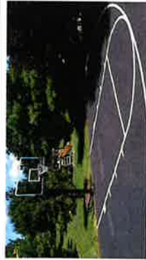
Basketball Courts w/ Asphalt Flooring (84x50' NCAA)