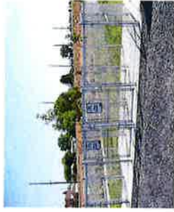
Galvanized Chain Link Fence by All American Fence