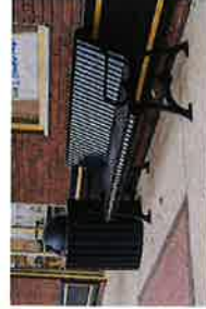
6'-0" Long Stool Bench w/ Arms by Kay Park & Recreation