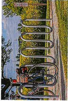
Steel Bike Rack (6 Bikes) by Kay Park & Recreation