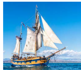
Hawaiian Chieftain

Marina - Tall Ships Return to Antioch Marina History comes alive again this March at the Antioch Marina! The Marina welcomes Historic Tall Ships, i.e.; the Lady Washington and Hawaiian Chieftain, from March 27 – March 31. These ships sail the waters each year providing