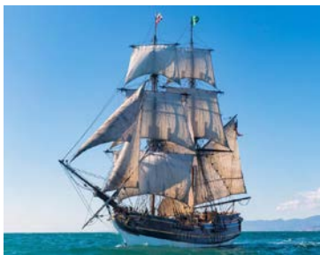
Lady Washington

On weekdays, schools can reserve a trip aboard the tall ships for the Historical Seaport's one-of-a-kind maritime heritage field trip, Voyage of Explorers . On weekends the tall ships are open to the general public for ticketed Adventure Sail , Evening Sail , and Battle Sail events. For the seasickness-prone but curious, stationary dockside Vessel Tours are available Tuesday - Sunday for a $5 suggested donation. Lady Washington and Hawaiian Chieftain can also be Chartered for private events, including weddings and workplace team builders.