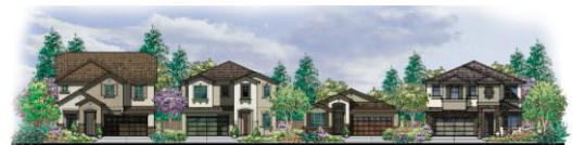
OAKLEY KNOLLS ANTIOCH, CA

On April 10, 2018, the City Council will consider the Oakley Knolls project, a 28-unit residential subdivision on 5.56 acres. The project is located on Oakley Road, near the terminus of Honeynut Street and will include a 7,665 square-foot private park. Information about this project is available here