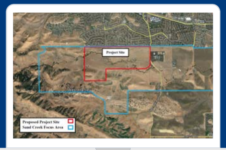
See agenda and staff report for the July 1, 2020 Planning Commission meeting <u>here</u>

The Planning Commission was supportive of the project and recommended that the City Council approve the project, including all of the above actions. This application will go to the City Council for final action on July 28 , 2020 .