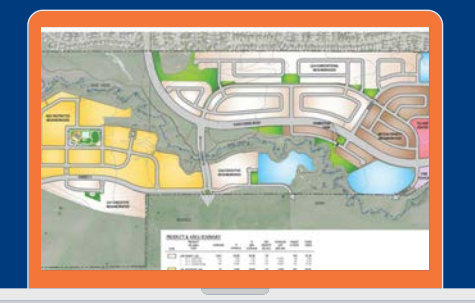
The proposed Master Development Plan can be found <u>here</u>