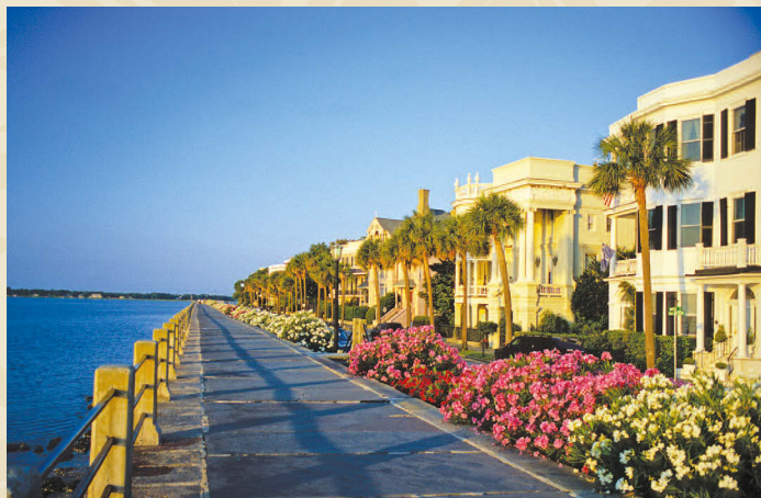
Walk along the Battery on the Harbor in Charleston, South Carolina

Bid a fond farewell to Savannah and leave with wonderful memories of the South’s most beautiful cities. Meal: B